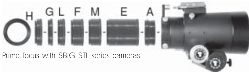
2. Prime focus with SBIG STL series cameras